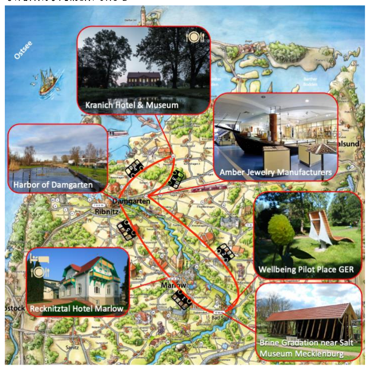
Vänligen notera att programmet kan komma att ändras