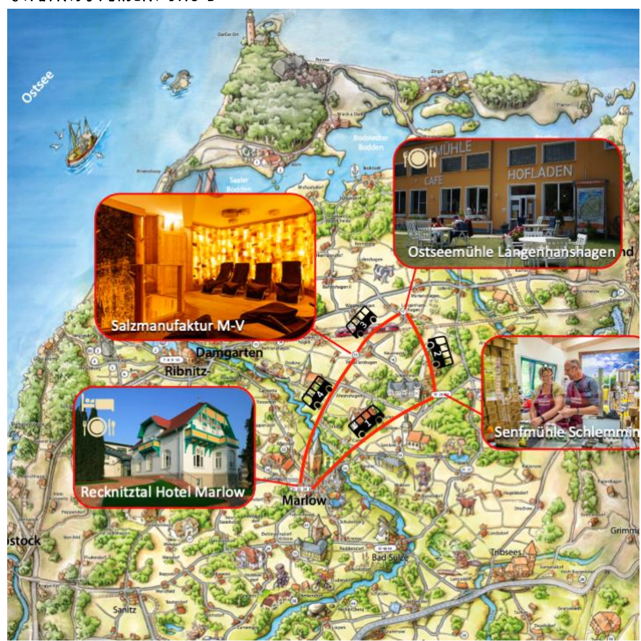
Vänligen notera att programmet kan komma att ändras